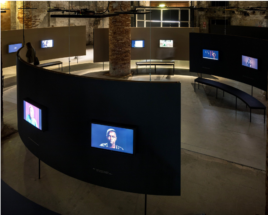
Figure 1. Disobedience Archive (The Zoetrope) , 60th International Art Exhibition – La Biennale di Venezia, Stranieri Ovunque – Foreigners Everywhere .

significant element among those that the Disobedience Archive has incorporated for its zoetrope-inspired installation: namely, the simultaneity of vision for a group of spectators who, each positioned before a screen, find themselves inserted into a “machine” that opens up multiple subjective paths which can change from visit to visit (Campagnoni 1997, 2007). The various panels, suspended within the very long spaces of the Corderie dell’Arsenale , emerge midway along the entire exhibition path as a device with both centripetal and centrifugal force. This compels the viewer to enter its spiral, or, if they choose not to follow its trajectory, to quickly traverse it by zigzagging. This article argues that it is precisely the topology of the spiral, and the forces, positions, and paths that it entangles, that function as a dynamic tool allowing users to deconstruct the established narratives.